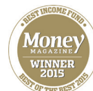
Bentham Global Income Fund